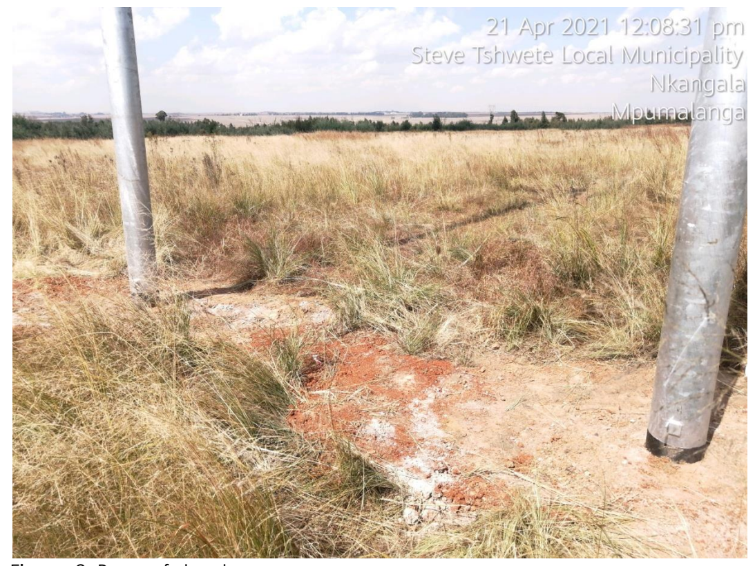
Figure 2: Base of structure.