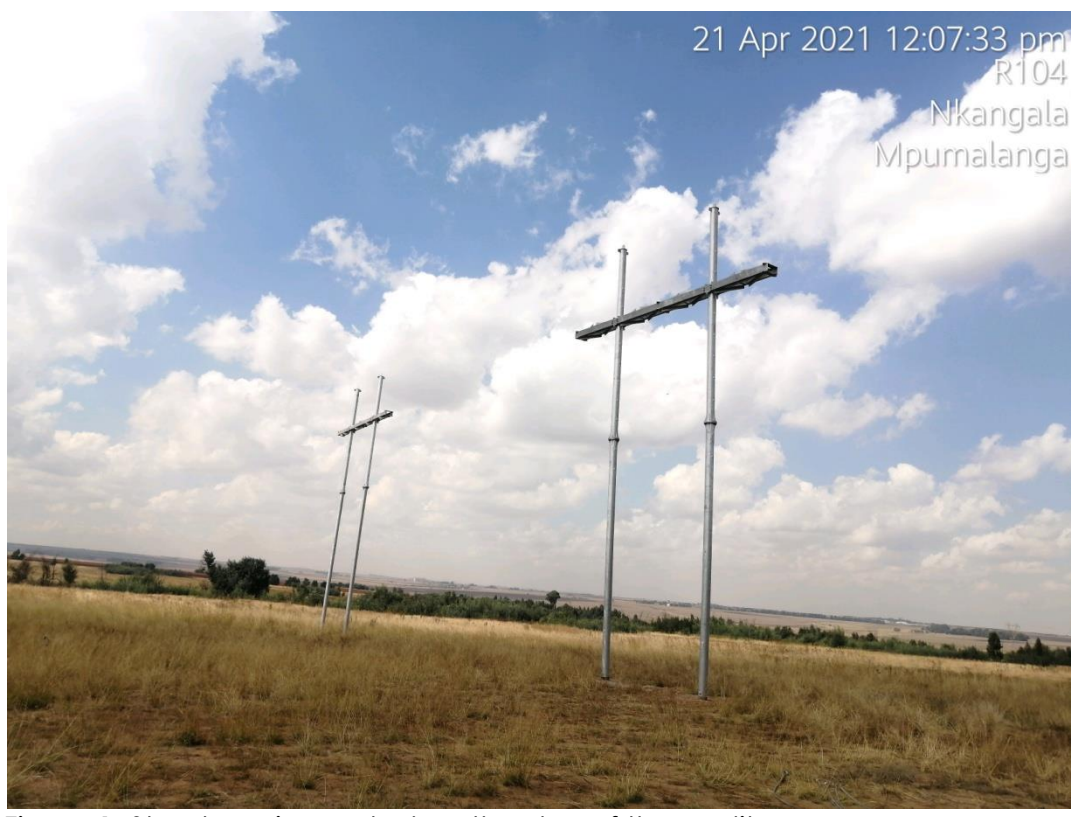
Figure 1: Structures inspected on the day of the audit.