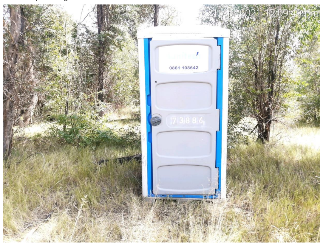
Figure 3: Ablution on site.