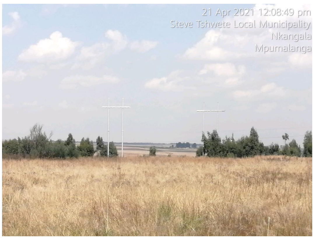
Figure 4: Structures inspected on the day of the audit.